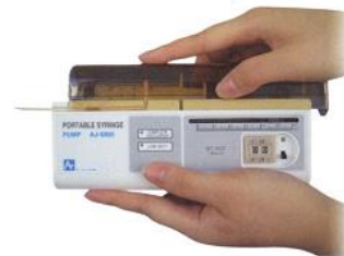
Portable/light in weight