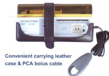
Convenient carrying leather case & PCA bolus cable